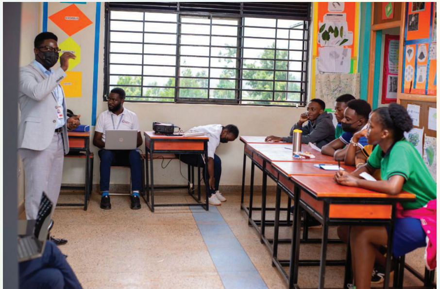
Year-II students during their career guidance session.

We cannot underscore the importance of having the conversations around personal interests and career as early as possible with your children. The best fit is if the eventual area of career is aligned with a child’s natural giftings.