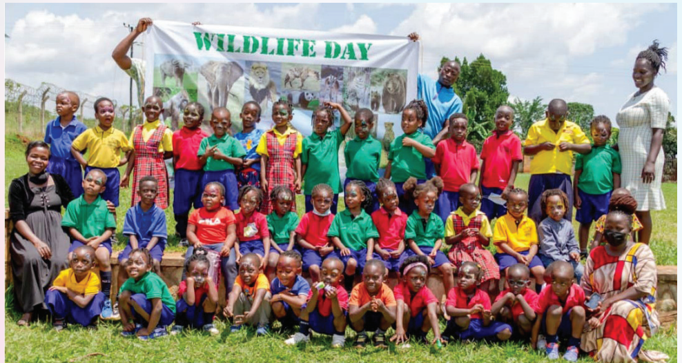
Preschool students strike a pose for a class picture