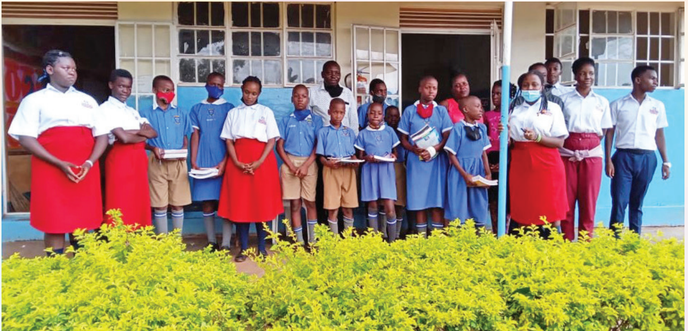
High School Students at Nambula for Community Outreach

On Thursday afternoon at exactly 2 pm, the high school students set off to what was to be the first of several community outreach activities. Everyone boarded the vans with their recycled products to educate the students of P5 – P7 at Nambula Primary school.