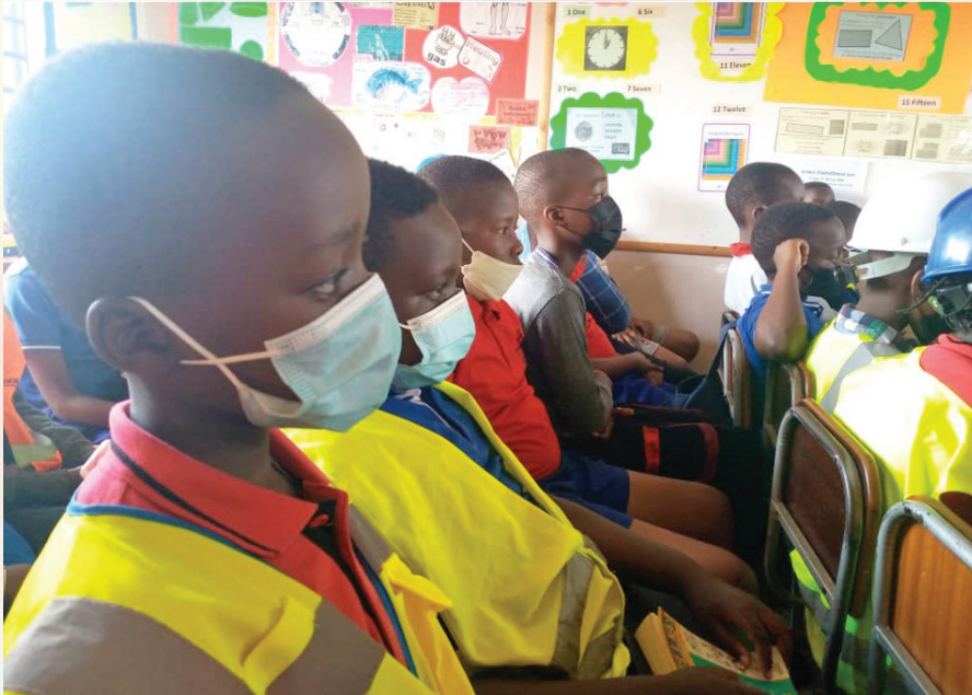
Young Engineers listening to a presentation from one of their peers.