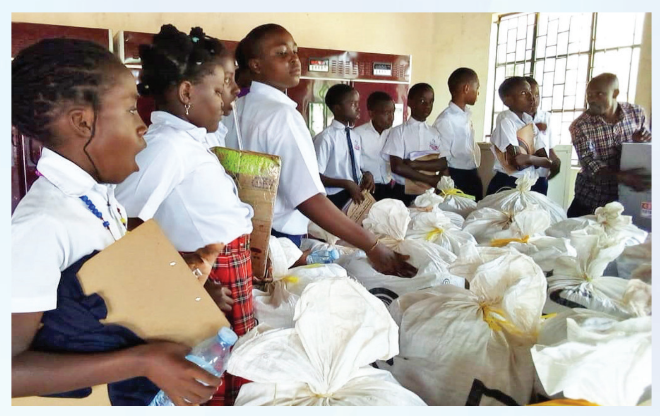
Y6 pupils at National Agriculture Research Organisation (NARO)